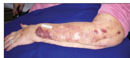
Left arm 9-7-07

The plan of action includes referring her to the dietitian for evaluation and encouragement of fluid intake. Wear long sleeves and begin the repair cream to arms and legs twice daily. She was also encouraged to wear her jewelry on the outside of her clothing.