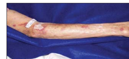
Right arm 9-7-07