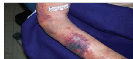
Right arm 10-5-07