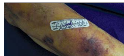
Right arm 11-7-07