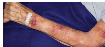
Left arm 9-7-07

FH is an 84yr. old female resident with a medical history that includes diabetes, Alzheimer’s with dementia, hypertension and coronary artery disease. She is totally dependant on staff for her care. Her medications include anticoagulants. Risk factors include history of skin tears, averaging 2 to 3 skin tears per month, usually on the lower forearms and wrist. Her unique high risk also includes that she was combative at times and had a tendency to “pick” at her skin as well as clothing and bandages. Plan of action included food and fluid studies (trying to improve hydration), long sleeves or gerigloves and the topical nourishing skin care cream containing Olivamine to arms and legs twice daily.