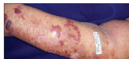
Left arm 11-7-07