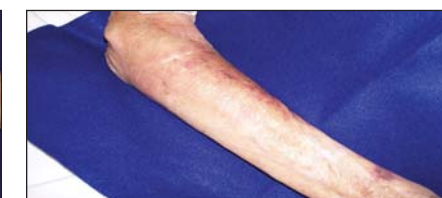
Right arm 11-16-07