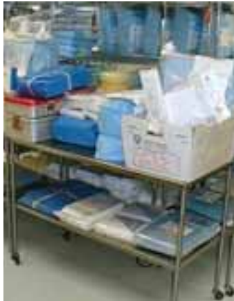
A Medline account prior to the use of CDS