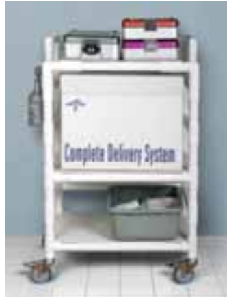
A Medline account in a case cart system