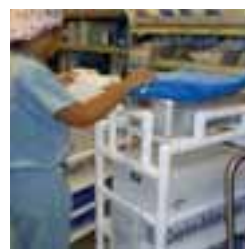
Decreased Picking Time