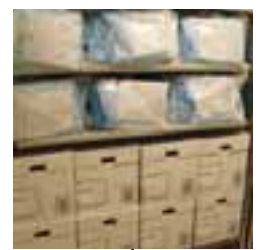
Lower Inventory Levels

With a comprehensive CDS program, all of your disposable perioperative supplies are in one container.