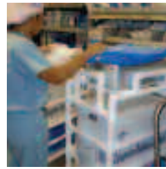
Decreased Picking Time