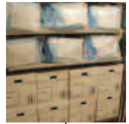
Lower Inventory Levels